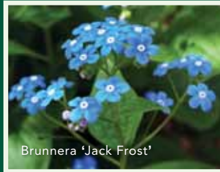
Brunnera 'Jack Frost'