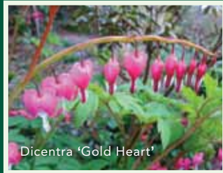
Dicentra 'Gold Heart'