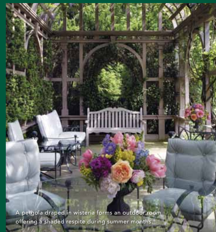
A pergola draped in wisteria forms an outdoor room offering a shaded respite during summer months.

The impressionistic style of Monet has been translated into a landscape with a plant palette changing with every season. From colorful foliage in the fall and hearty greenery in the winter to pastel tulips in the spring and bright pink and purple impatiens in the summer, each season offers a different approach to elegant landscape design.