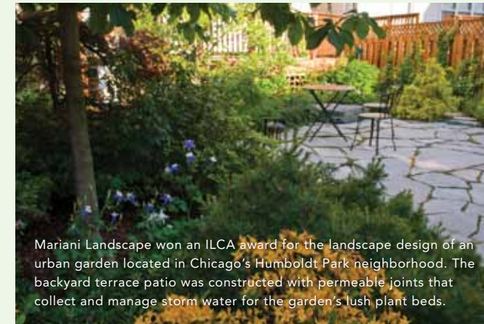
Mariani Landscape won an ILCA award for the landscape design of an urban garden located in Chicago’s Humboldt Park neighborhood. The backyard terrace patio was constructed with permeable joints that collect and manage storm water for the garden’s lush plant beds.

Mariani Landscape offers a selection of earth-friendly adjustments for any home’s landscape