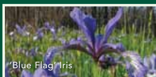
‘Blue Flag’ Iris