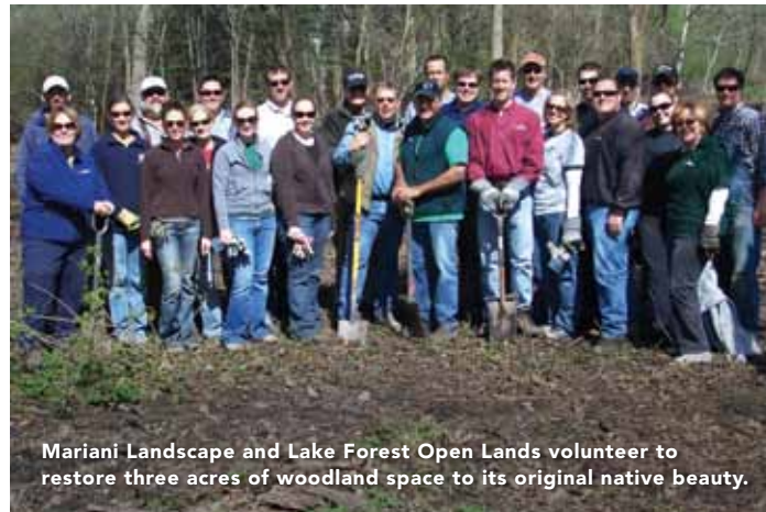
Mariani Landscape and Lake Forest Open Lands volunteer to restore three acres of woodland space to its original native beauty.