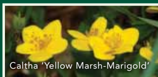
Caltha ‘Yellow Marsh-Marigold’