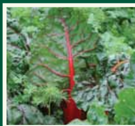
Beta vulgaris var. swiss chard

Kohlrabi belongs to the cabbage family and got its name from a German word meaning "cabbage-turnip". Both the leaves and swollen underground stem are edible, specially the stem which can be green, white or purple. Its flavor is more mild than a turnip's. If young and tender they may be eaten raw, very thinly sliced. Diced or julienned kohlrabi is good in salads, stir-fries, coated in batter and deep fried or steamed.