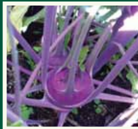
Brassica hybrid var. kohlrabi 'Purple Azur Star'

Kohlrabi belongs to the cabbage family and got its name from a German word meaning "cabbage-turnip". Both the leaves and swollen underground stem are edible, specially the stem which can be green, white or purple. Its flavor is more mild than a turnip's. If young and tender they may be eaten raw, very thinly sliced. Diced or julienned kohlrabi is good in salads, stir-fries, coated in batter and deep fried or steamed.